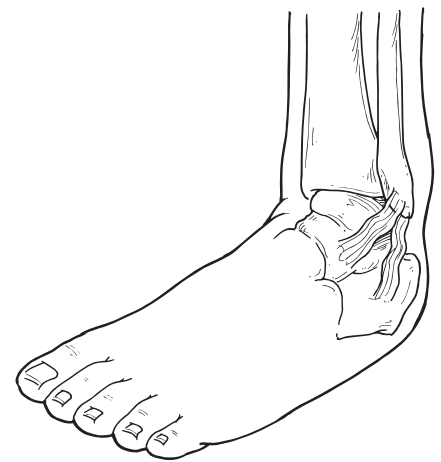
Injured ankle with laxity of ligaments

surgeon will ask you about any previous ankle injuries and instability. Then he or she will examine your ankle to check for tender areas, signs of swelling, and instability of your ankle as shown in the illustration. X-rays, CT scans, or MRIs may be helpful in further evaluating the ankle.